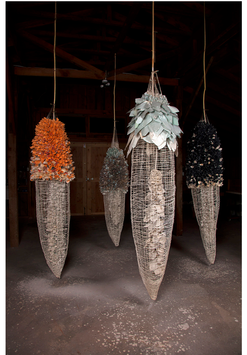
A dramatic view of Hutchinson's human-sized sculptural work.

Describing the process behind her work, the artist says, "Each project whether it is a museum commission or a new body of work handled by a gallerist, is the result of thoughtful research. Most invitations are a chance to celebrate that specific place. I look for the untold story within the research of place or something that resonates metaphorically with the tension and realities within our cultural existence. Once research is complete and I have a conceptual focus, that supports image collection of specific growth patterns within the plant world or diverse historical imagery. The research and the image collection renders the development of new drawings on possible form directions. This research also encourages harvesting specific materials to use in the sculptural work (blue jeans and sugar beet pulp by-product), color and tone, and siting and display possibilities."